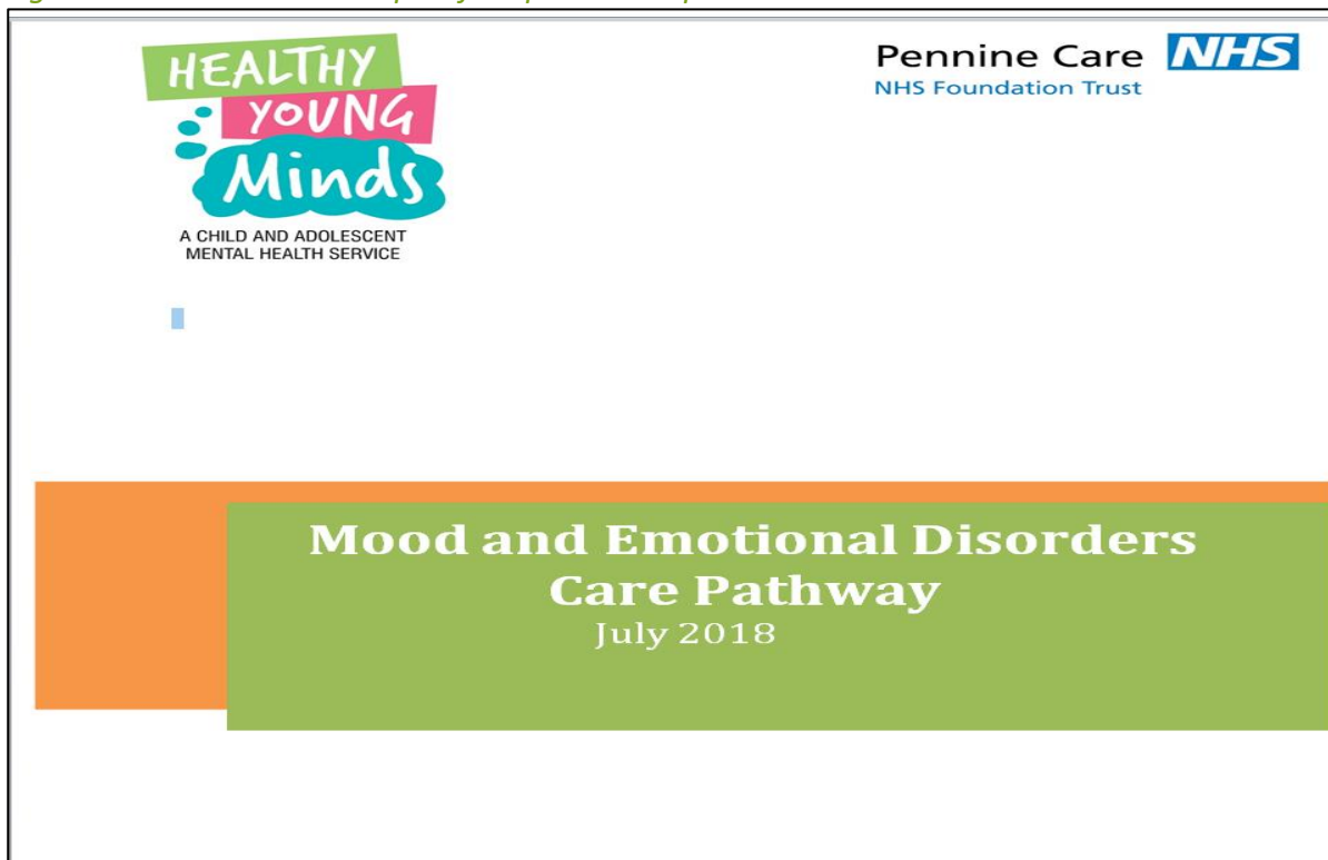
Fig 3: Tameside and Glossop self-help resource pack

Some of the self-help resources found to be highly useful were; HeadScape, Kooth, Ayemind, Young Minds among others.